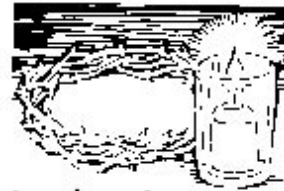
Service of Darkness

Come experience the power of this original dramatic piece that features the talents of local actors and musicians to tell the events of Jesus' last days according to Matthew. Feel the power of the Passion of The Christ.